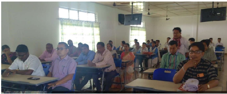
Parent Teacher Meet, Department of History