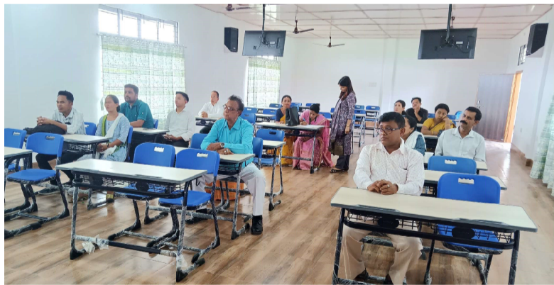
Parent Teacher Meet, Department of English