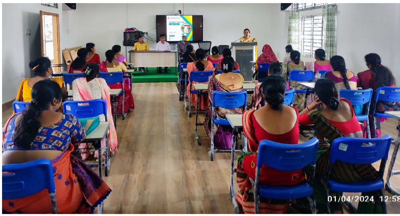
Parent Teacher Meet, Department of Commerce