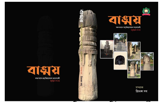
'বাংময়' সৰুপথাৰ মহাবিদ্যালয়ৰ বাৰ্ষিক আলোচনীঃ