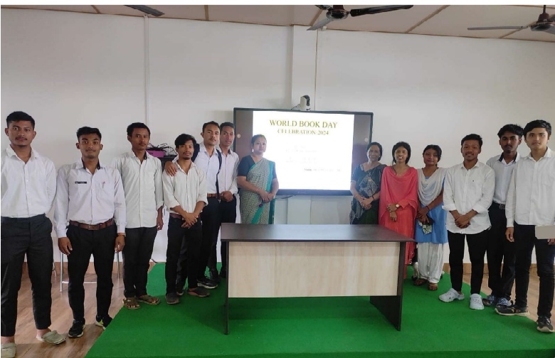
World Book Day observed by Library and Innovation Cell