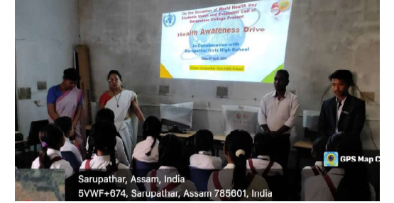
Health Awareness Programme