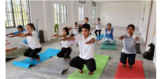
Students practising Yoga at Sarupathar College