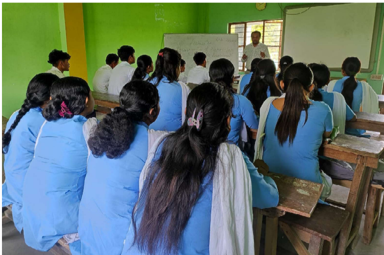
Special lecture on "Conservation of Nature for Sustainable Development" organised by Nature Club